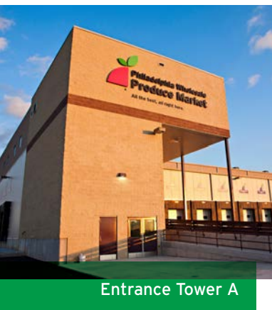
Entrance Tower A