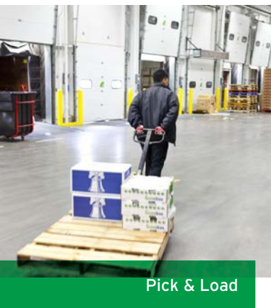
Pick & Load